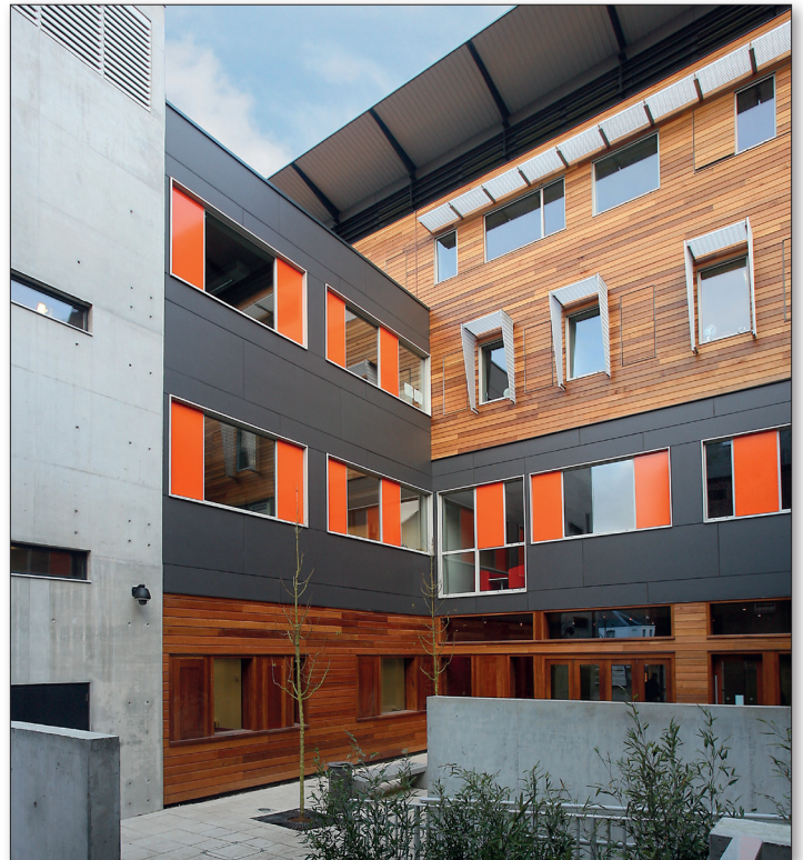
Above: York St.John University

We are able to assist with the specification, design, material sourcing, build and fixing for any project where cladding, facades and acoustic panelling is required.