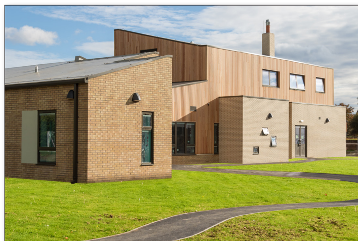
Above: Lincoln Court - New Build - Cladding - York Left: Lincoln Court - Interior works - York