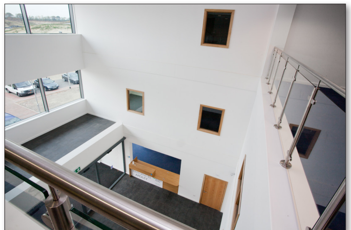
Below: RAF Marham