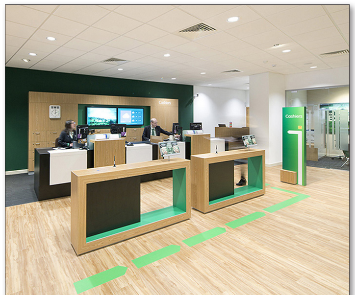
Above & Left: Lloyds Banking Group - refits