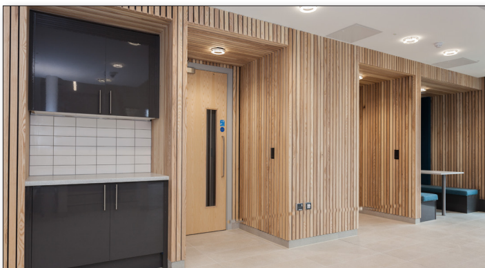
Above: Wolfson Centre - Bradford Royal Infirmary